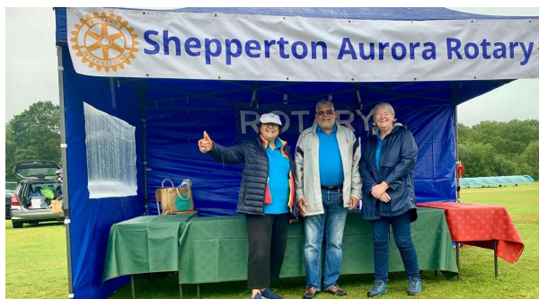
The very wet West End Fair