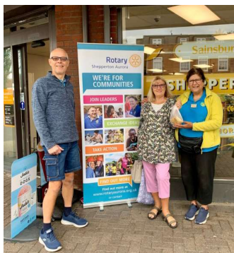
The First Sainsbury's Collection