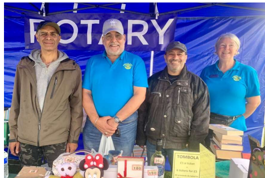
The very wet West End Fair