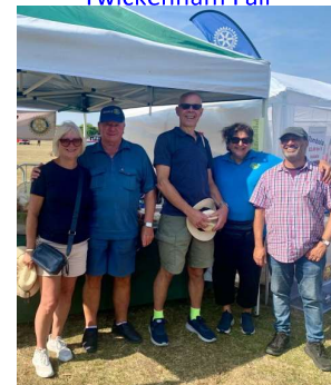
At Ashford Classic Car Show